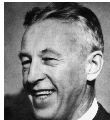
AA's founders, Bill W., above, and Dr. Bob left.

be $10 each. The money from the raffle pays for Founders' Day, leftover funds will go to the Central Office's budget.