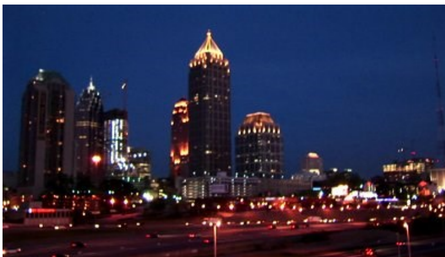
Atlanta will host this year's International Convention in July.

Registration information and brochures are available on the AA website – www.aa.org . Registration will remain open throughout the convention.